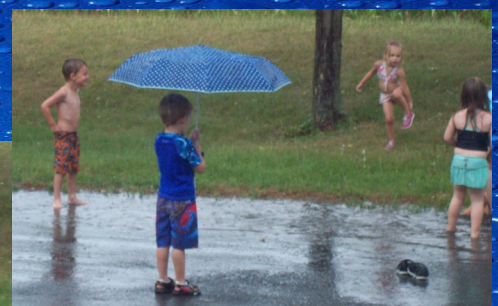
God's rain and a new mud puddle are all it takes for a fun-filled afternoon!