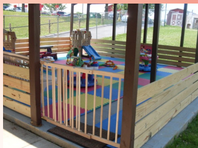
The Kidz Corral