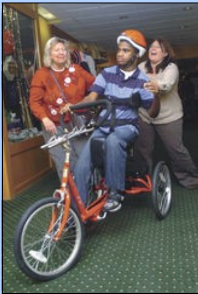
This article and photo appeared in the Altoona Mirror December 2009.